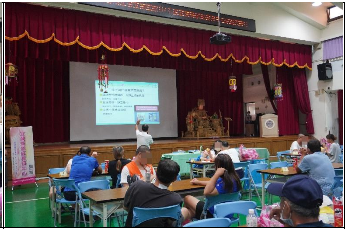
A scene of the event