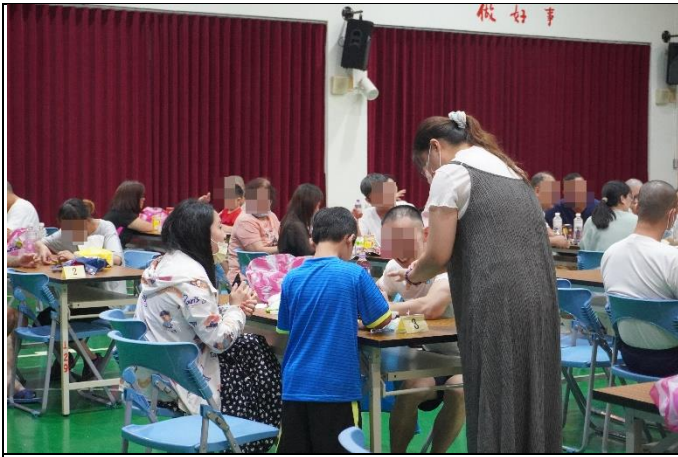
A scene of the event