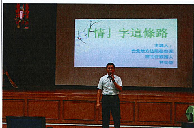
The Chief graced the occasion