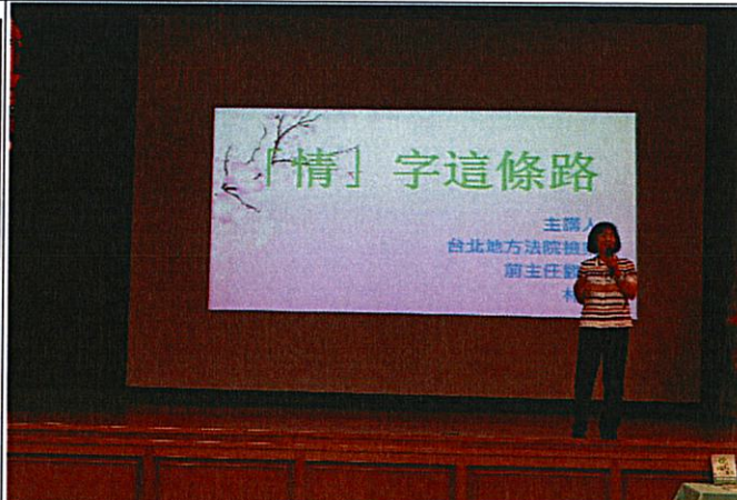
A scene of the event