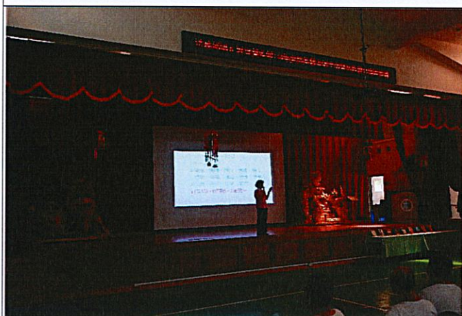
A scene of the event