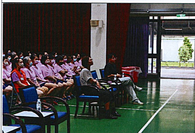
A scene of the event