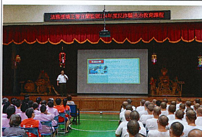
A scene of the event