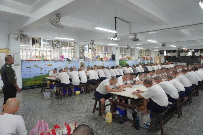
A scene of the test