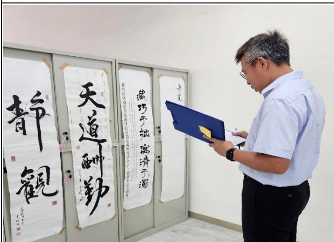
Evaluated by The Chief Chou