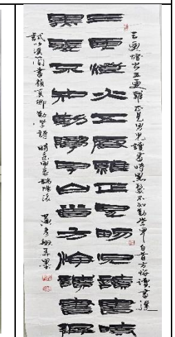
The 3 rd Prize