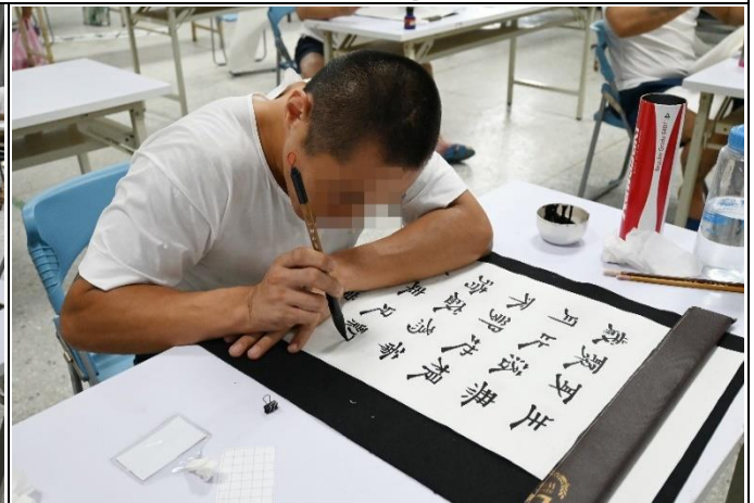
A scene of the event