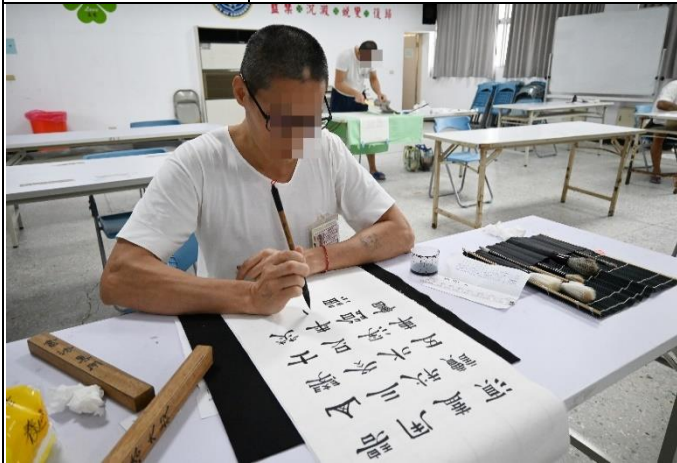
A scene of the event