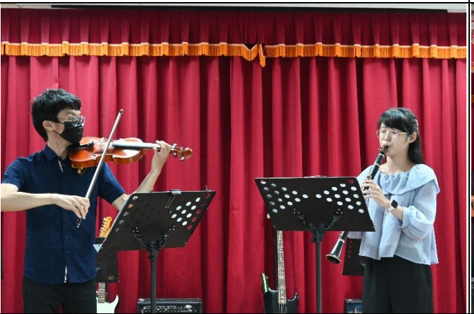
The performance by the guest