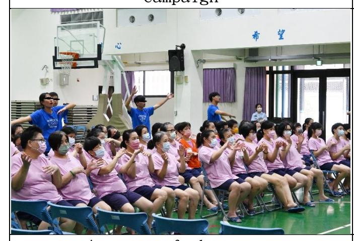
A scene of the event