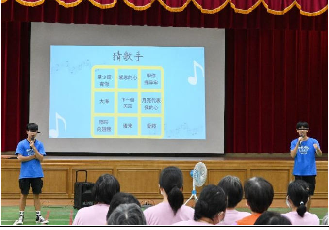
A scene of the interactive activities