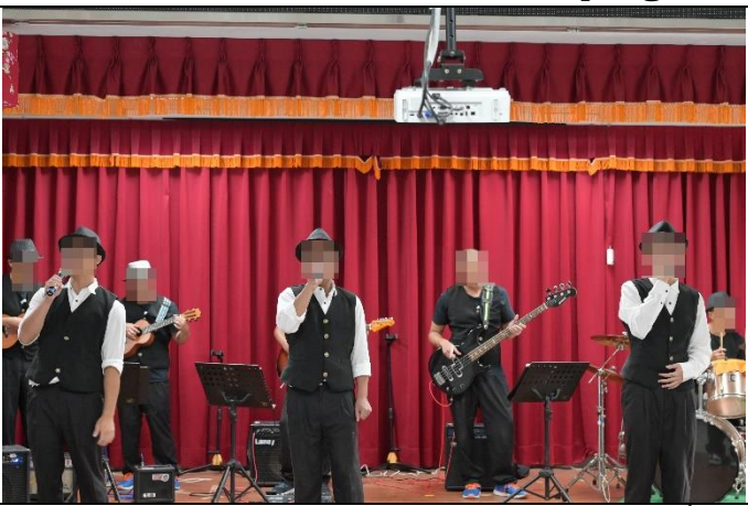
The performance by the Zhong 2<sup>nd</sup> Workshop