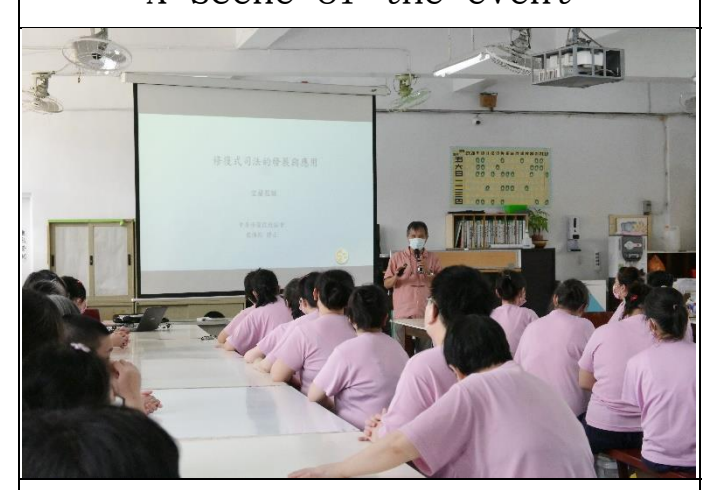
A scene of the event