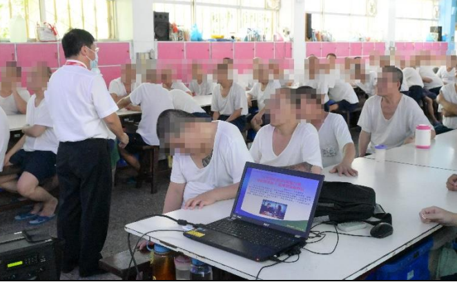
A scene of the event