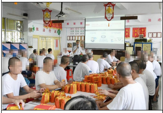
A scene of the event