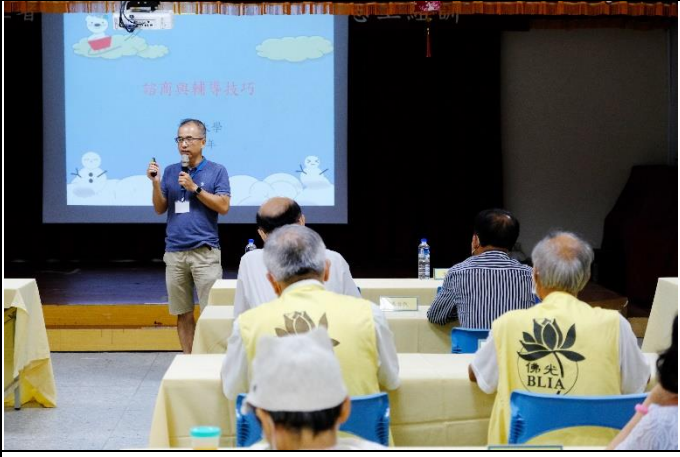
A scene of the event