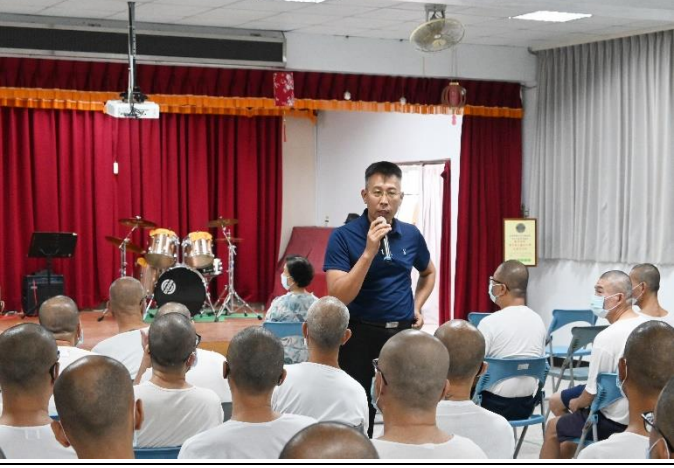
The Chief Zhou in the Campaign