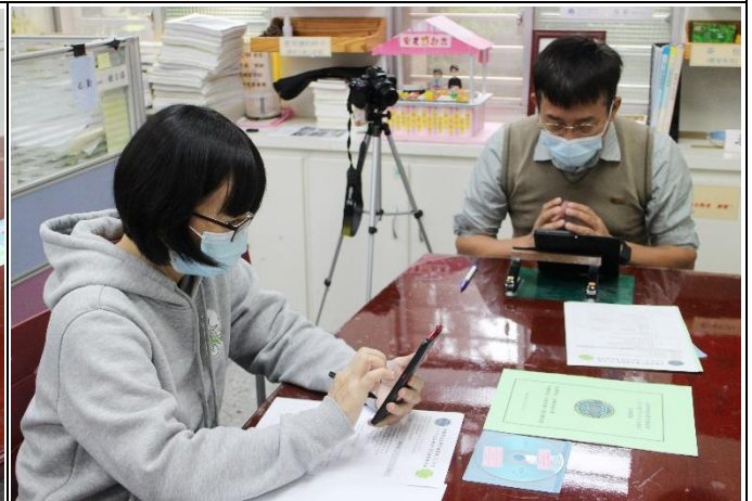
A scene of online meeting