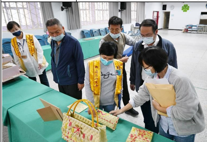
A scene of rating