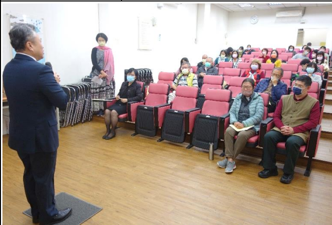
Discussing in main subject