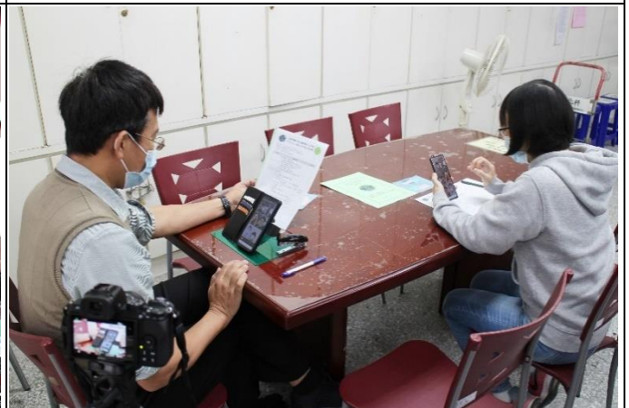
A scene of online meeting