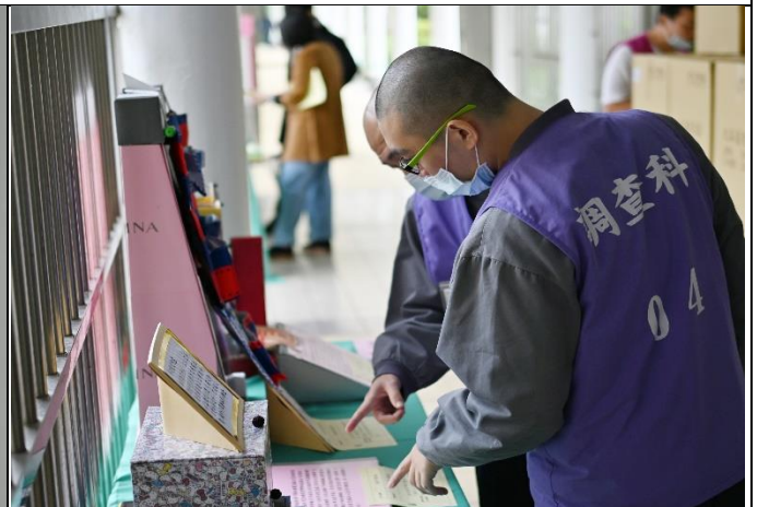
A scene of the exhibition