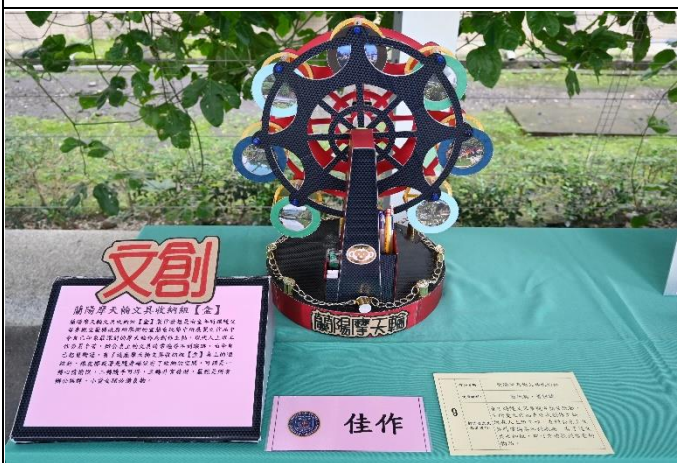
The work from competition