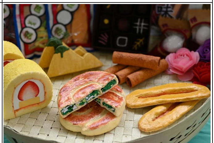
The work from competition