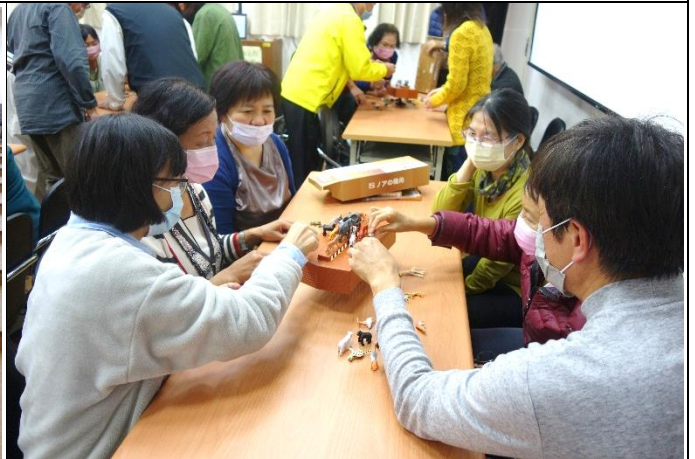
Discussing in main subject