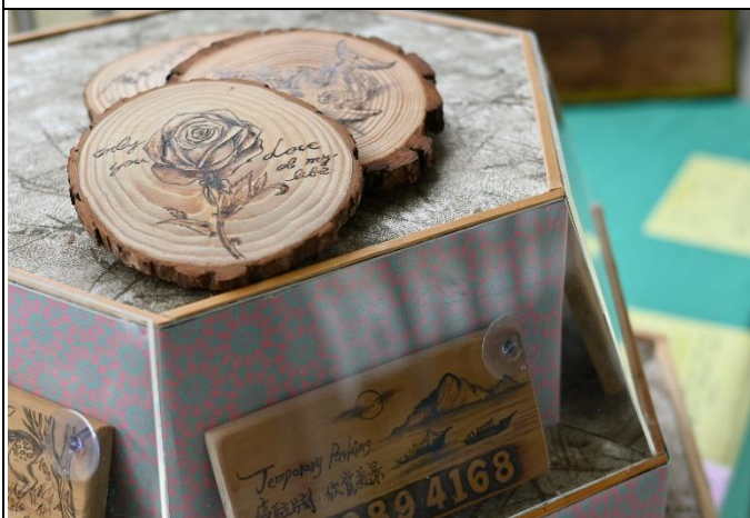
The second place