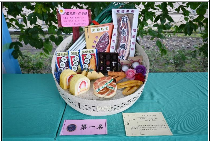
The first place