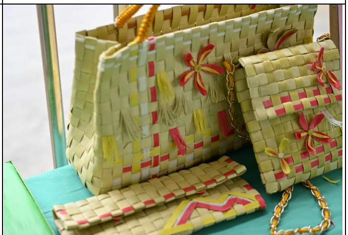
The second place