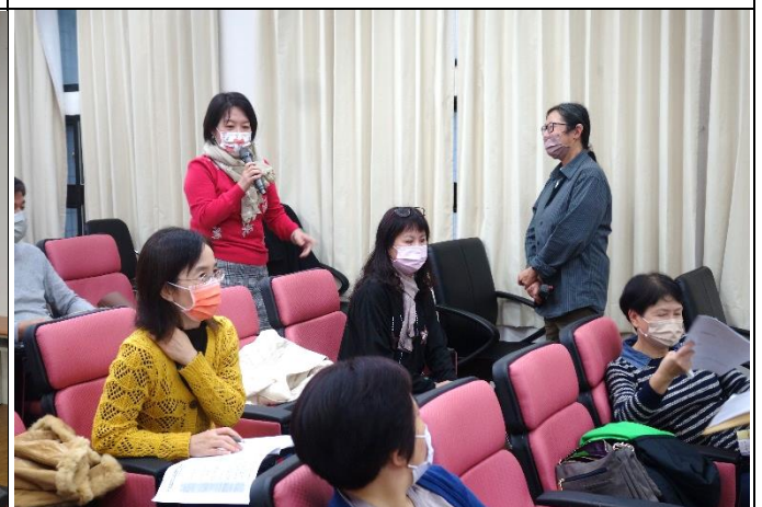
Experiment sharing from volunteer