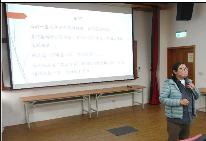
Case report and problem discussion