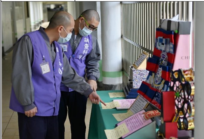
A scene of the exhibition