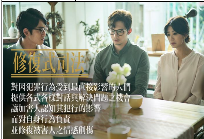
The theme of advanced course