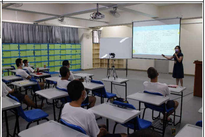
The scene of publicity