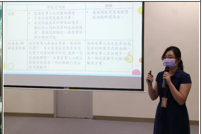
The scene of publicity