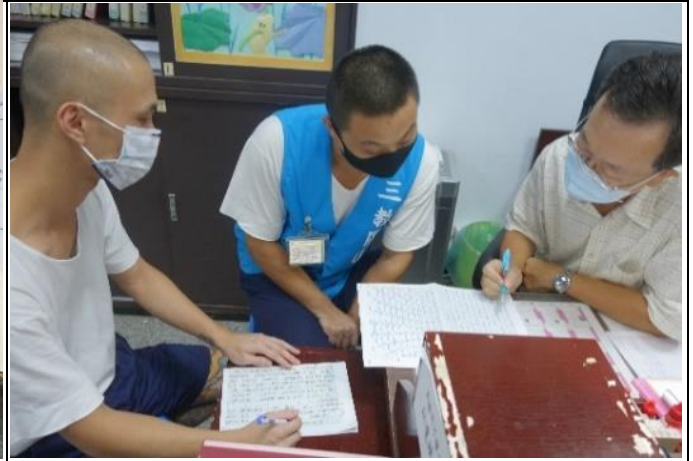
A mentor was instructing writing skills