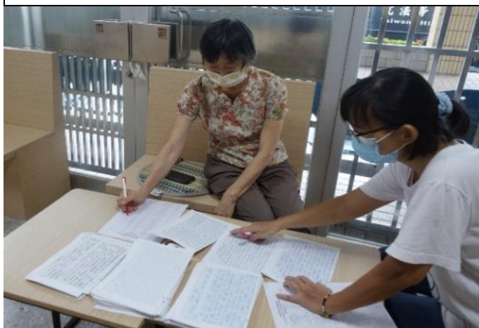
The compositions were graded by the judges