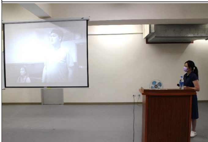
The scene of publicity