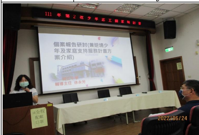
Discussing in main subject