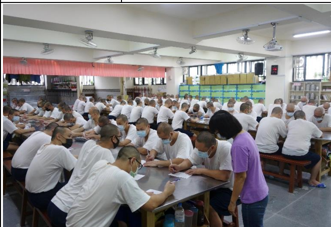
The process of inmate doing the exam