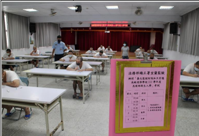
A scene of inmates taking exam