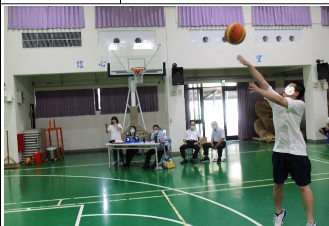
A scene of the competition for male