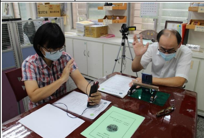
A scene of online meeting