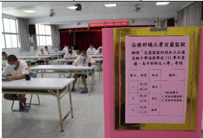
A scene of inmates taking exam