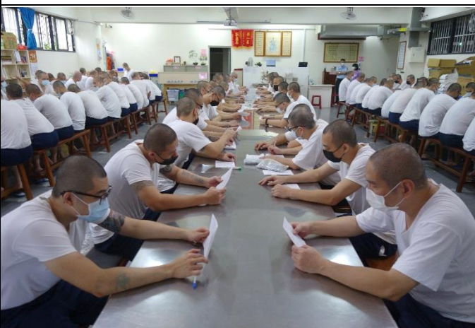
The process of inmate doing the exam