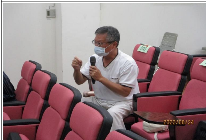
Experiment sharing from volunteer