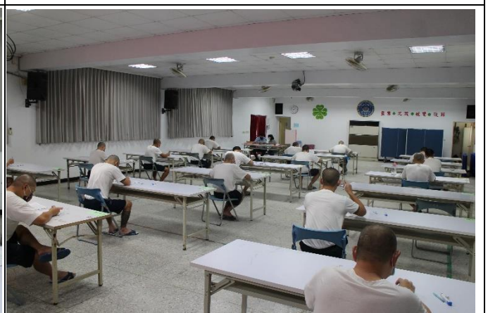
A scene of inmates taking exam