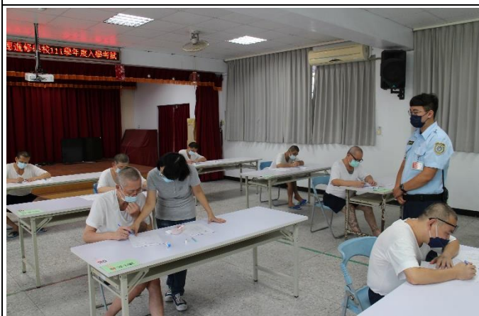
A scene of inmates taking exam