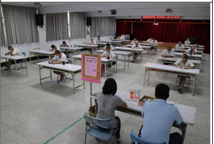
A scene of inmates taking exam