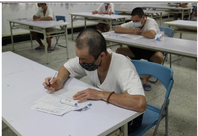
A scene of inmates taking exam