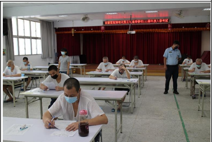
A scene of inmates taking exam