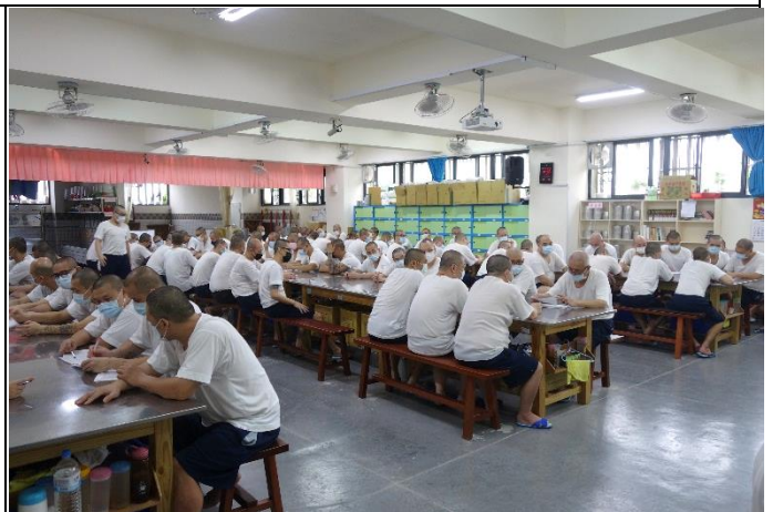
The process of inmate doing the exam