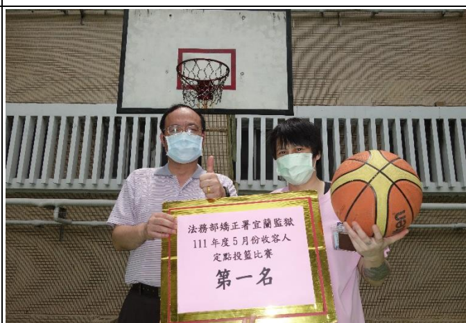
The first place of female