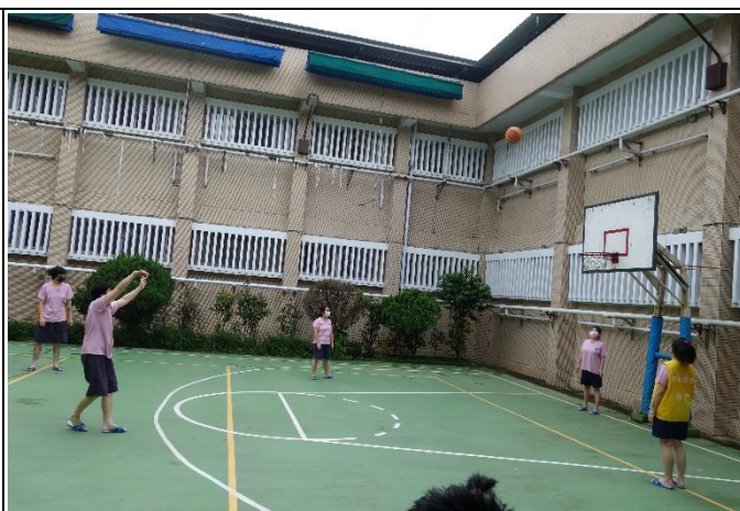
A scene of the competition for female