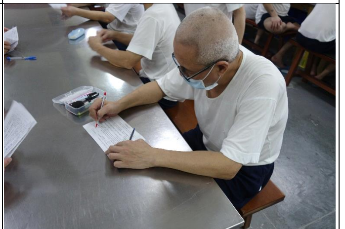
The process of inmate doing the exam