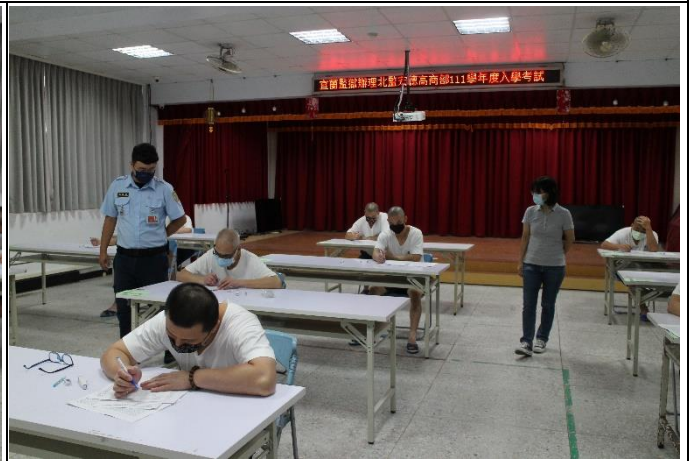
A scene of inmates taking exam