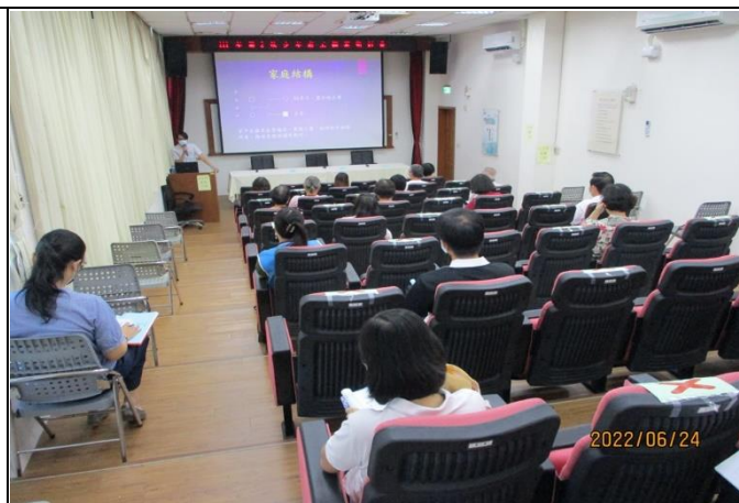
Case report and problem discussion