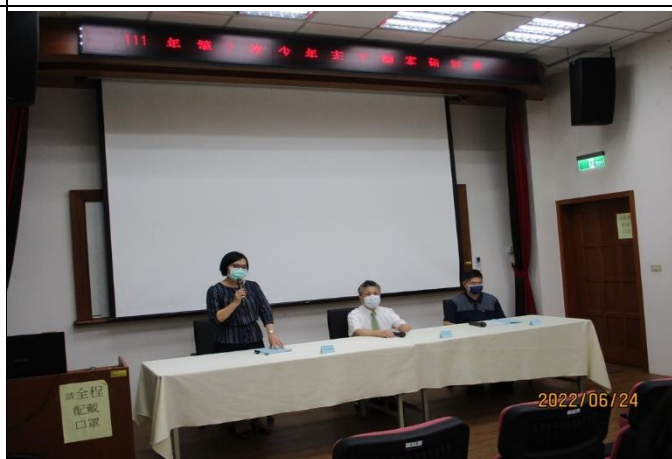
Directing by the instructors