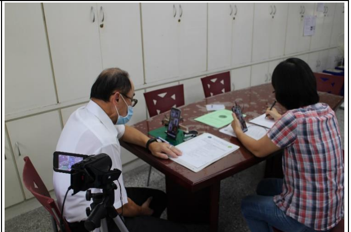
A scene of online meeting