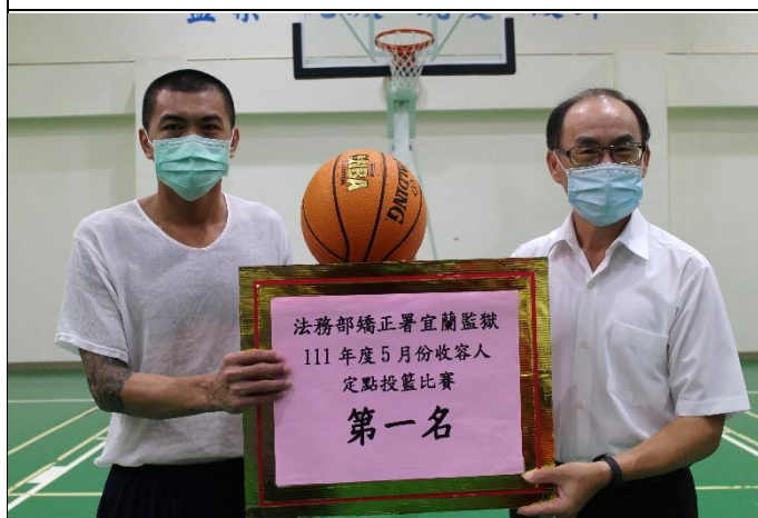
The first place of male