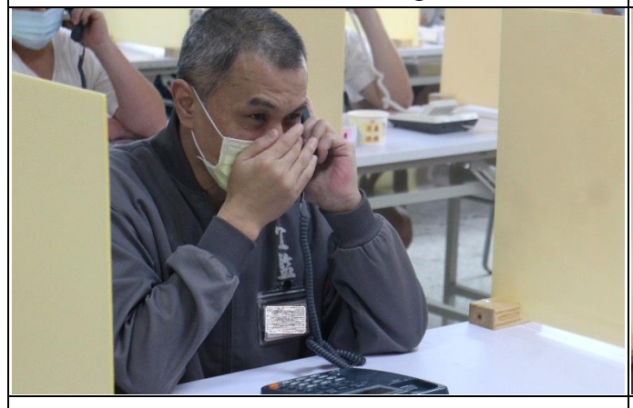
A scene of inmates were calling