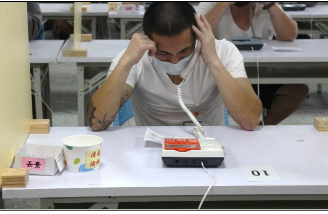
A scene of inmates were calling