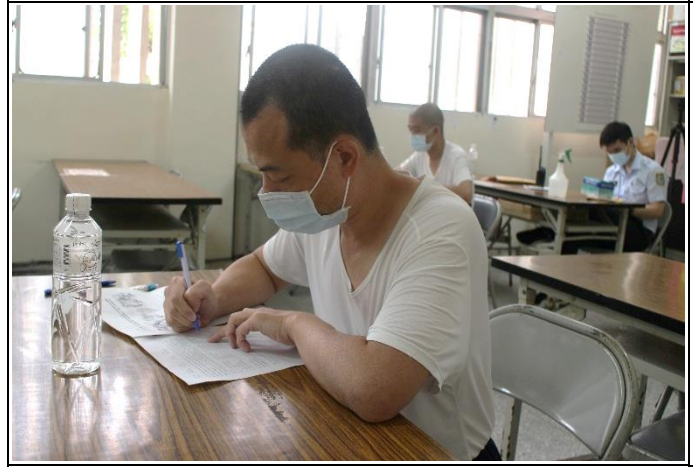
The inmates were focusing on the exam