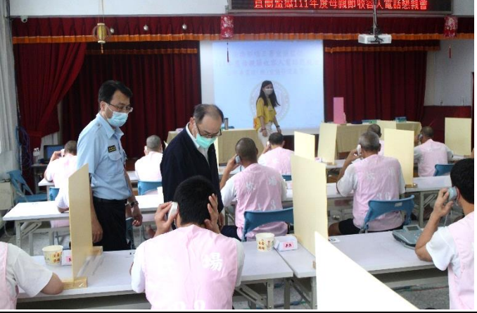
The Chief of Education and Rehabilitation Section were concerning about the situation of calling