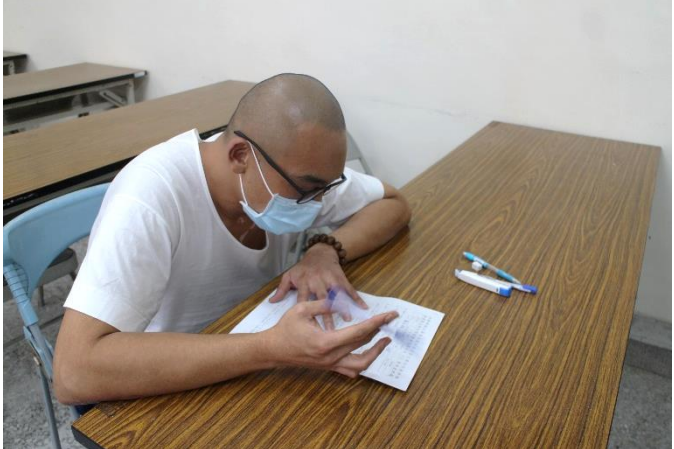
The inmates were focusing on the exam