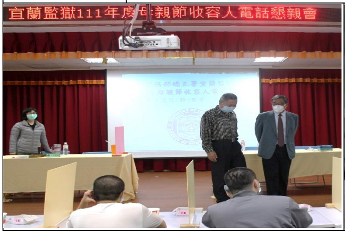
The Warden Tsai were concerning about the situation of calling