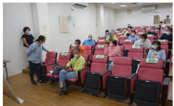
topic discussing and mutual communication for volunteers.