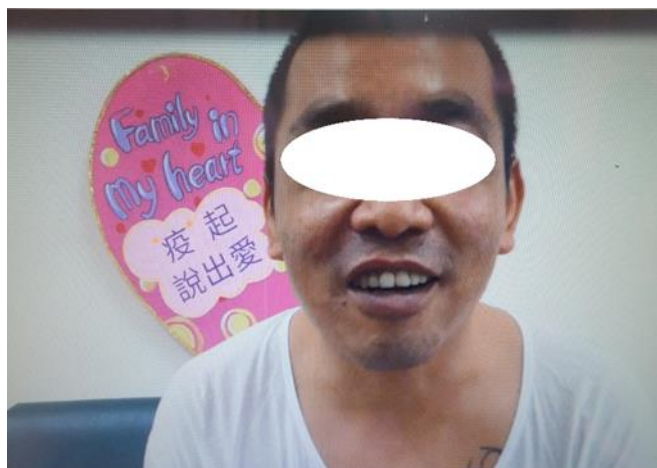
A scene from the event.