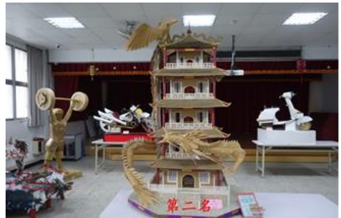
The second place.