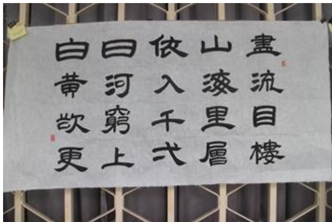
The first place.