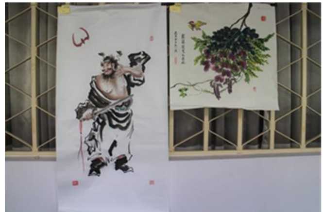
The first and second place.