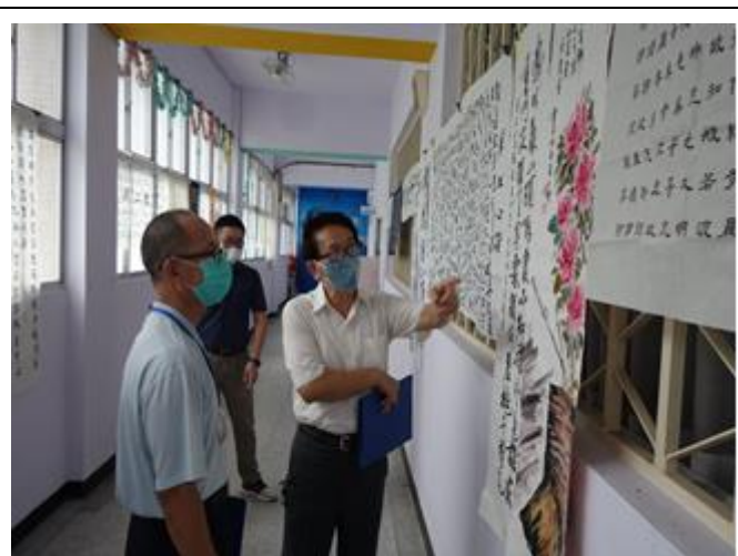
A scene from the grading day.