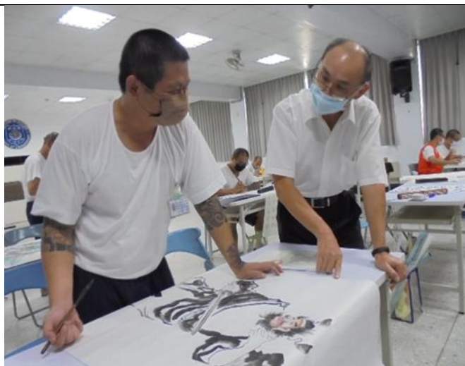
A scene from the finals.