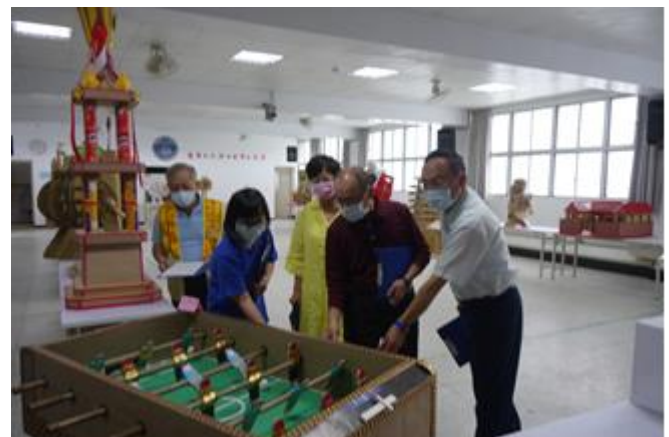
A scene from the grading day.