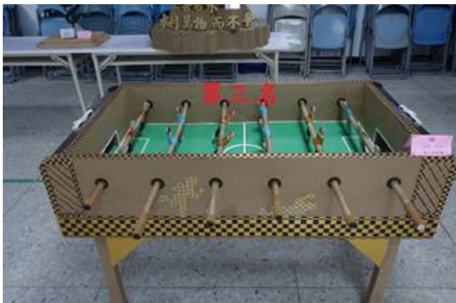
The third place.