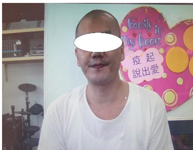
A scene from the event.