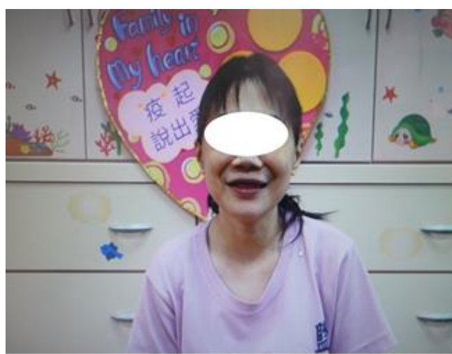
A scene from the event.