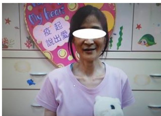
A scene from the event.