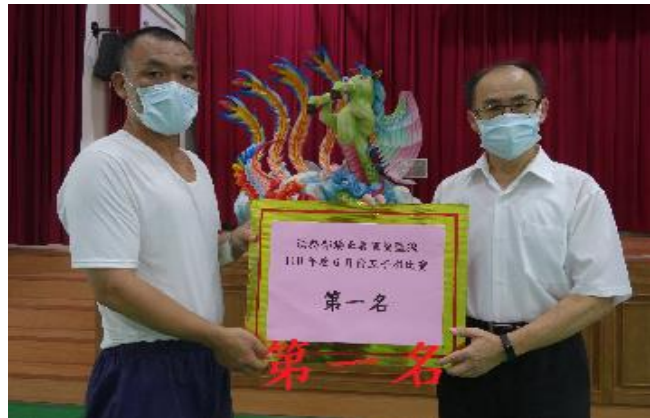
The Champion of Men's Group