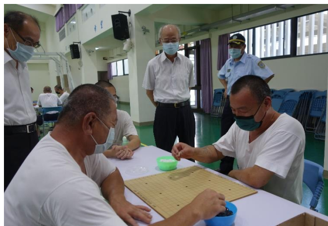
The Warden Visited in Person