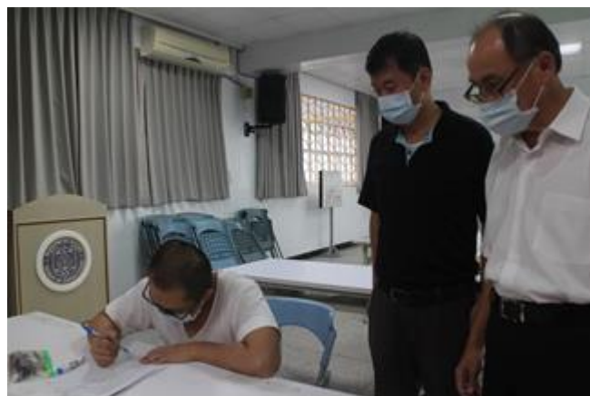
A scene from the exam