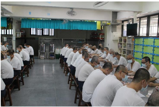
The inmates focused on the exam.