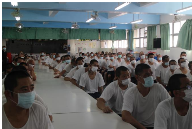
The inmates were attentive to watch the video