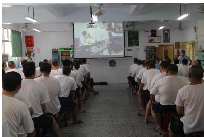
The inmates were attentive to watch the video