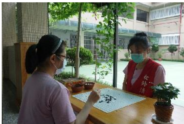
A Scene from the Woman's Spot