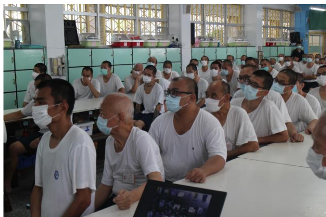
The inmates were attentive to watch the video.