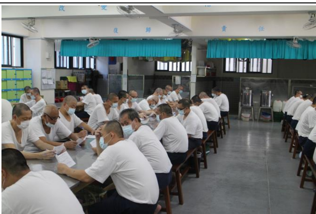
The inmates focused on the exam.