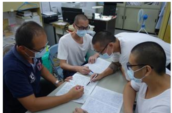
A mentor was instructing writing skills.