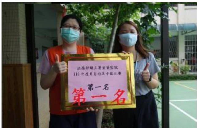
The Champion of Women's Group