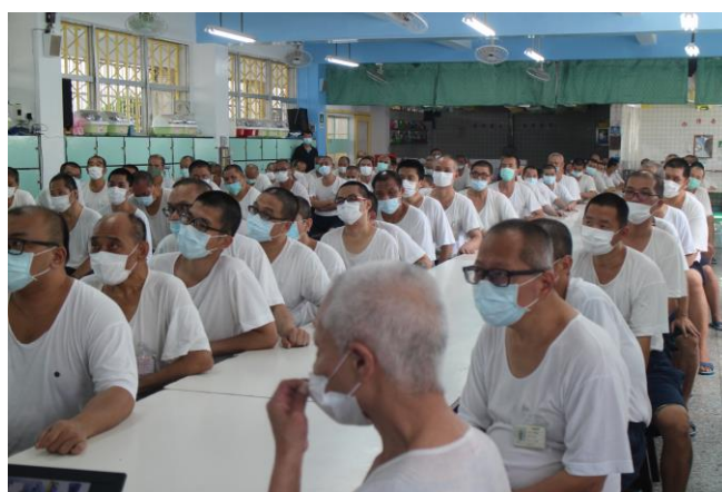
The inmates were attentive to watch the video