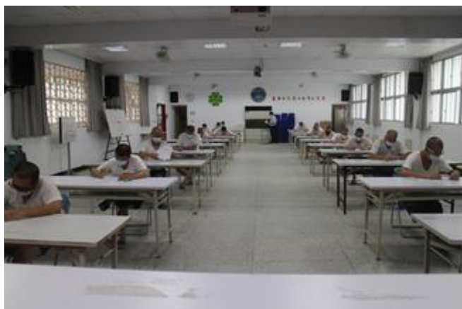
The inmates focus on the exam.