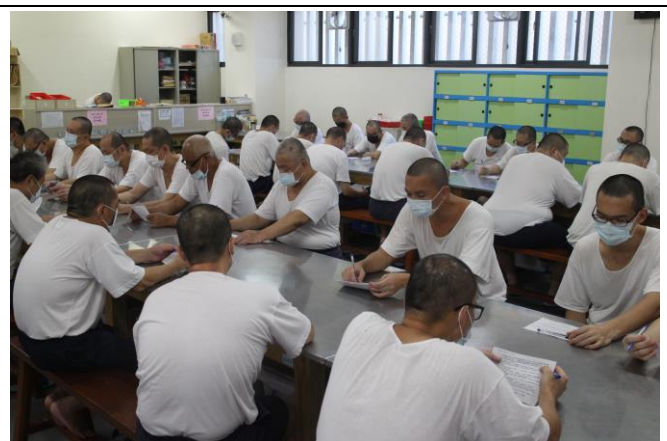
The inmates focused on the exam.