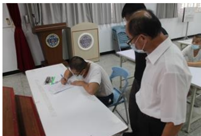
A scene from the exam