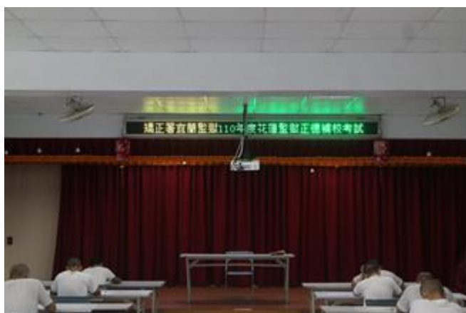
The inmates focus on the exam.