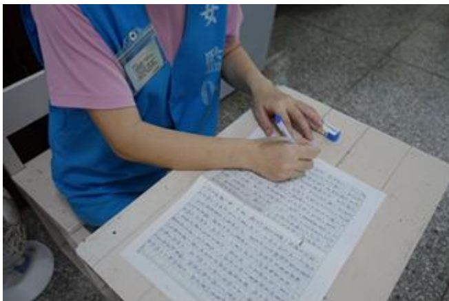
An inmate was writing the composition.