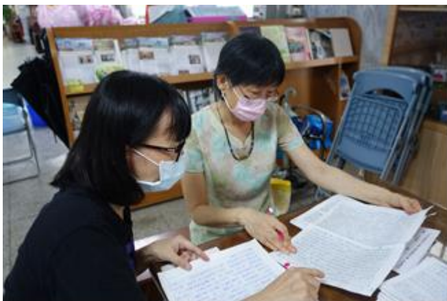
The compositions were graded by the judges.