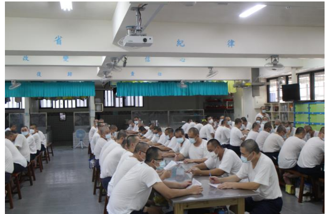
The inmates focused on the exam.